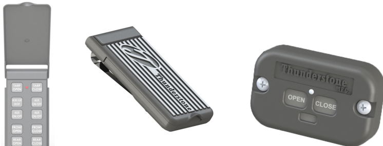
New Multi-Function Remote Included